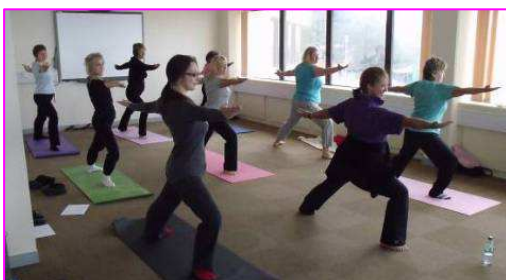
Yoga in Swansea Libraries