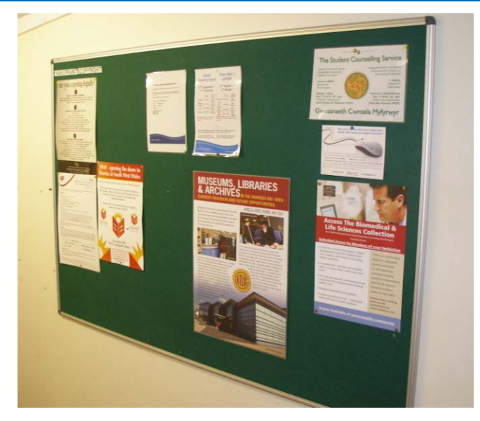
Adopt a notice board